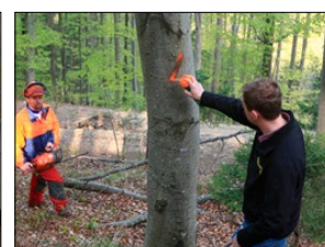
Forest assistants are an important link to forest owners and service providers