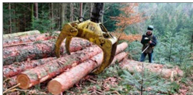
For small buyers, wood is usually measured on site